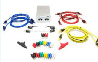
Voltage Module Accessories