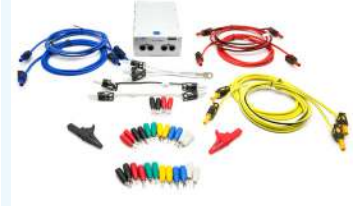
Current Module Accessories