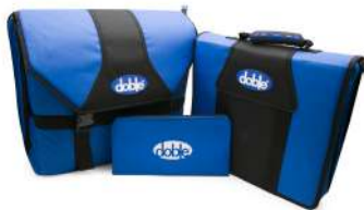
Instrument and Accessory Bags

The versatility of F8000-series Power System Simulators like this F8300 model let you easily scale your test capabilities to the requirements presented by your protection systems. Simply connect this F8300 to other F8000-series instruments to expand your use case possibilities.