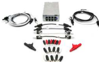
Logic I/O Module Accessories