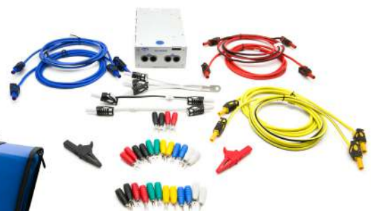
Current Module Accessories