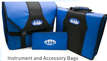
Instrument and Accessory Bags