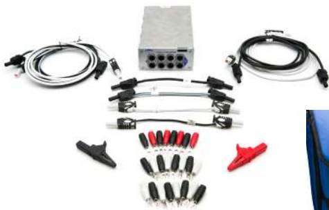
Logic I/O Module Accessories