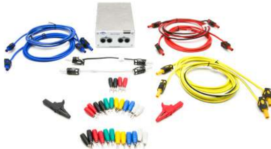
Voltage Module Accessories