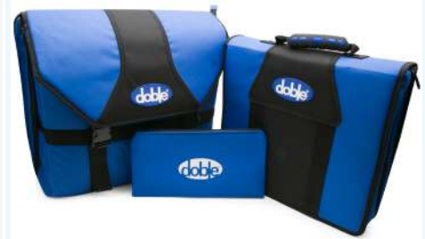
Instrument and Accessory Bags