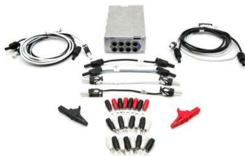
Logic I/O Module Accessories