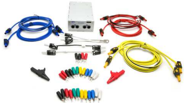
Current Module Accessories