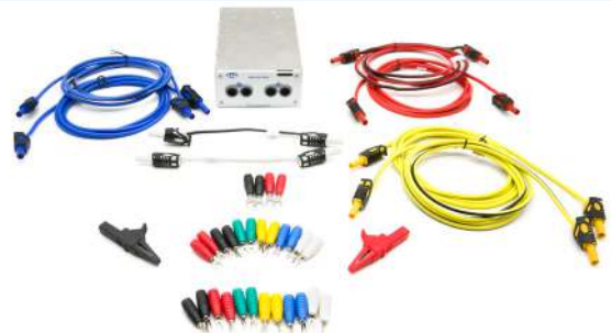
Voltage Module Accessories