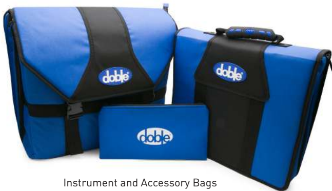
Instrument and Accessory Bags