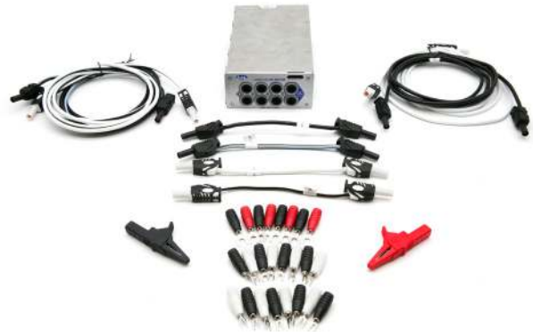
Logic I/O Module Accessories